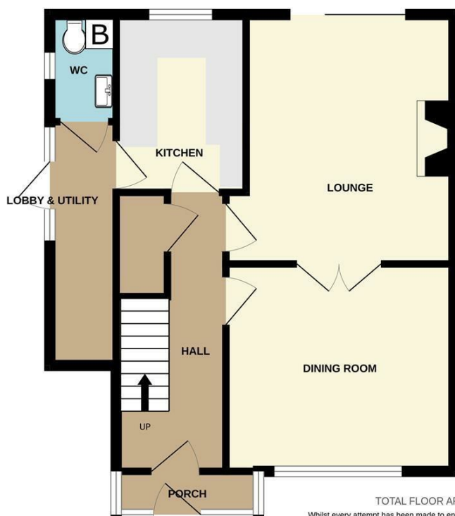
GROUND FLOOR 500 sq.ft. (46.5 sq.m.) approx.